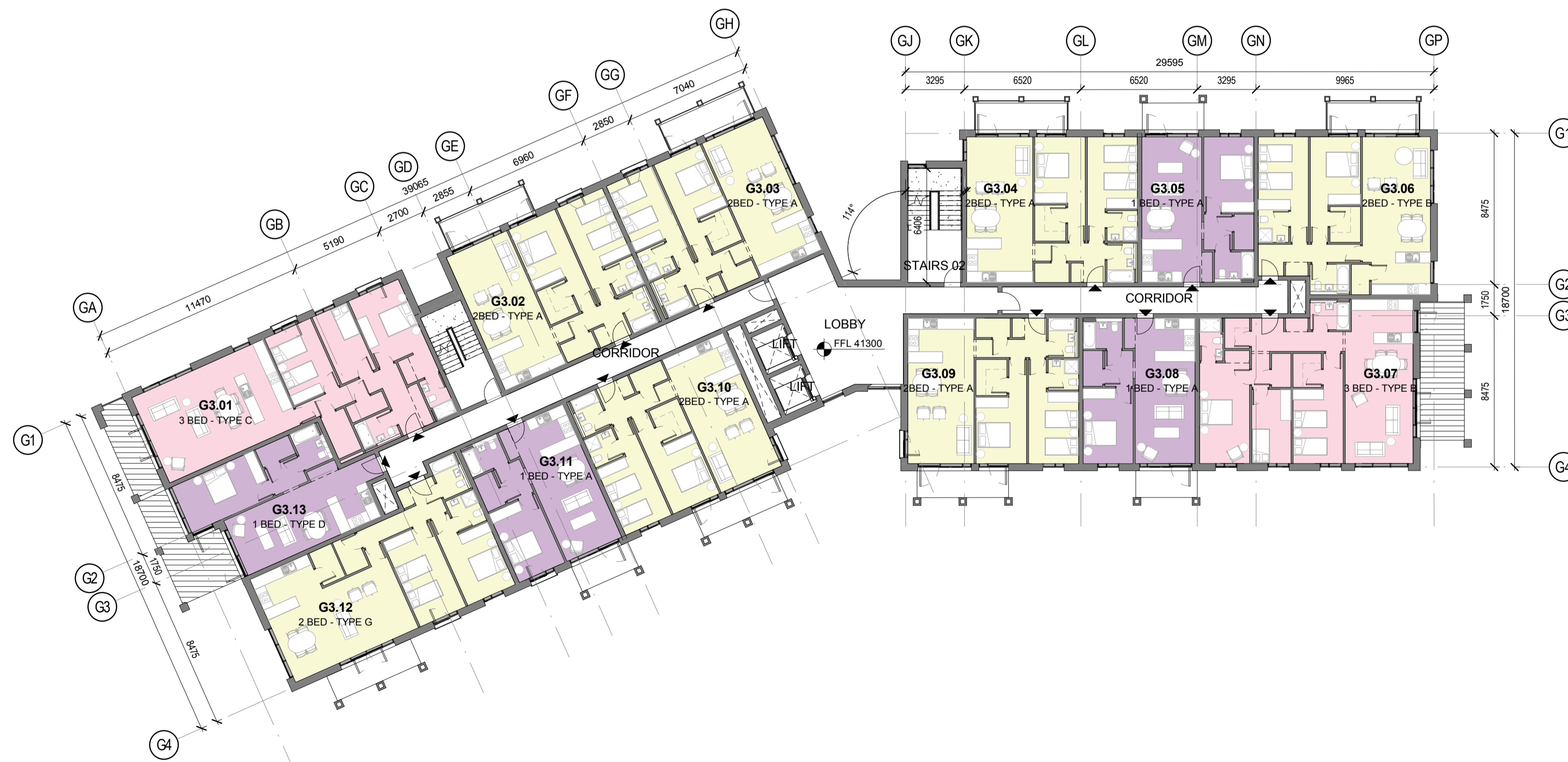
2 G_03 Third Floor 1 : 200